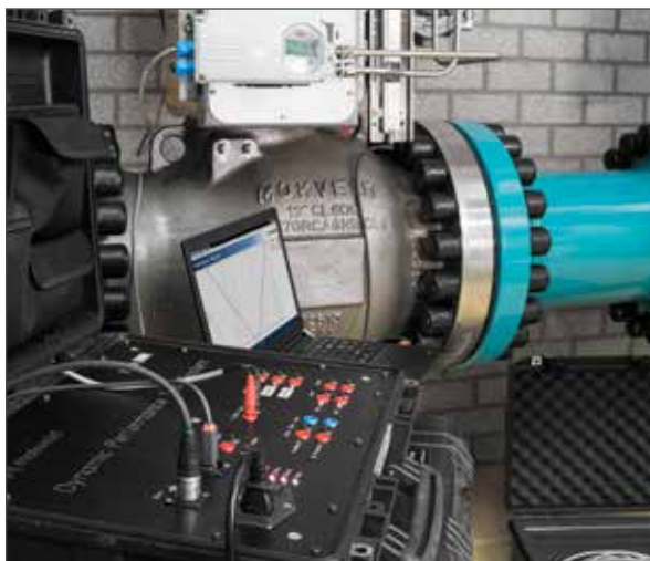
Mokveld's Dynamic Performance Test System

The Valve Diagnostic System allows Mokveld in close cooperation with your staff, to define a predictive maintenance strategy aimed at avoiding unnecessary equipment inspections. In addition, it enables an extended recertification cycle of safety and production critical equipment.